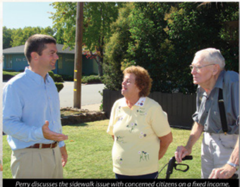
Perry discusses the sidewalk issue with concerned citizens on a fixed income.